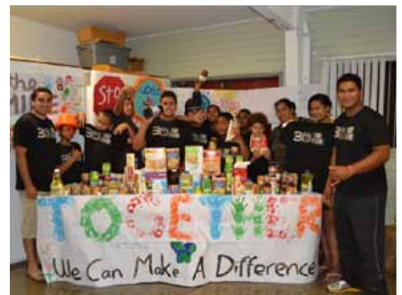
St. Elizabeth's youth with the 202 pounds of food and the artwork they created.