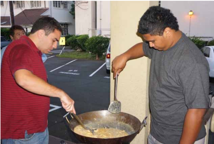
Every Wednesday morning, breakfast is served by St. Peter's with the help of St. Elizabeth's for Central Middle School students. Before eating breakfast, students play games, pray and help prepare some of the food.