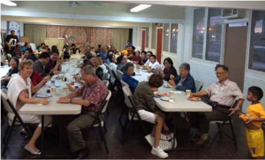
Yummy eats on Shrove Tuesday.