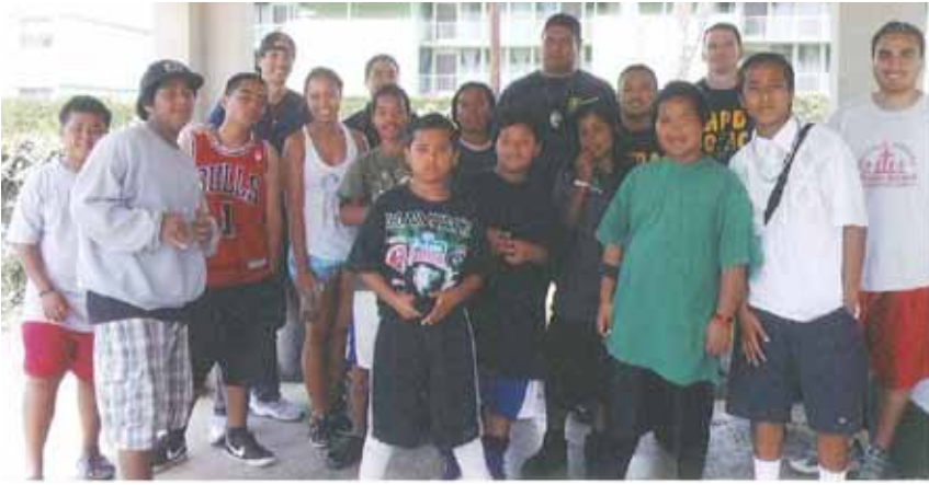
Last summer's Basketball players with the Weed and Seed staff picked up rubbish for a community service project.