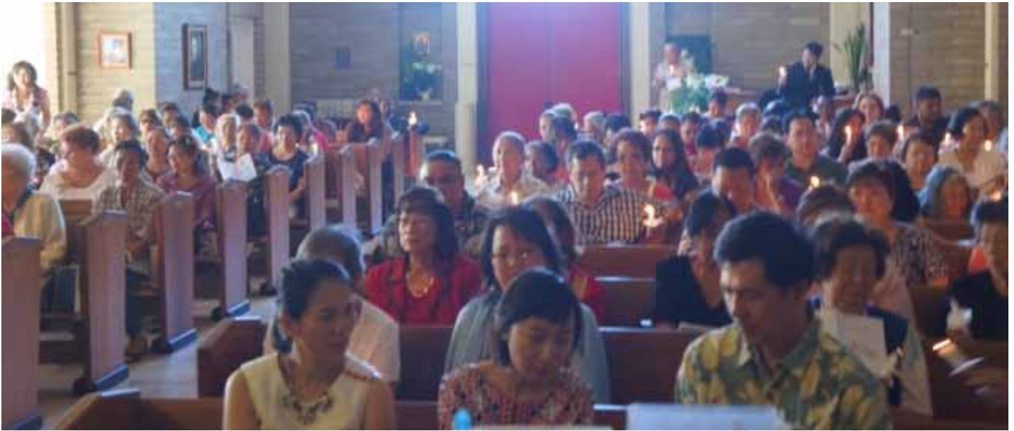
Even with 80 of our Tongan friends off to camp with Pacific Island Ministries, we had a full house for a joyful Easter celebration!