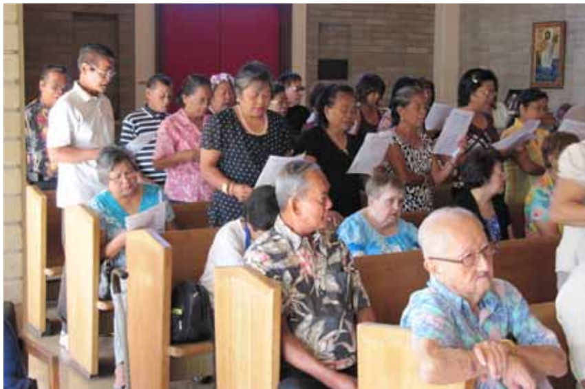
The Filipino Choir sang the offertory anthem on October 16th, titled “We thank you.”