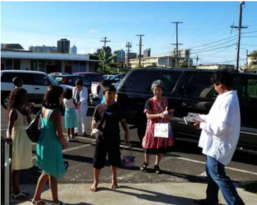
Worshippers were warmly greeted before the service.