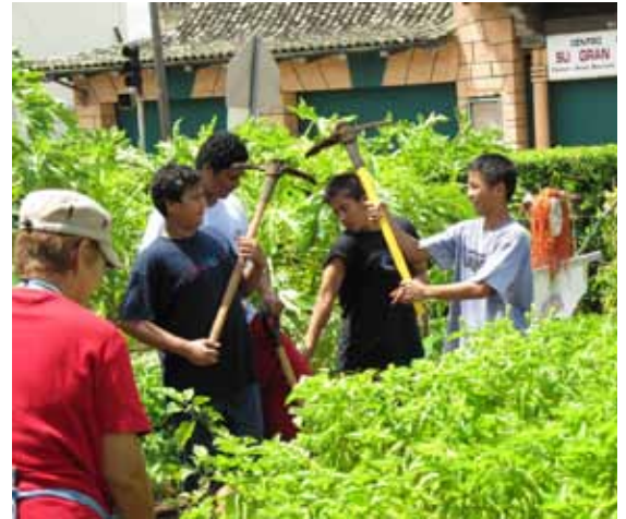
An All-Parish Work Day on April 16th preceded the Holy Week festivities. Here the youth of St. Elizabeth's practice being gladiators!