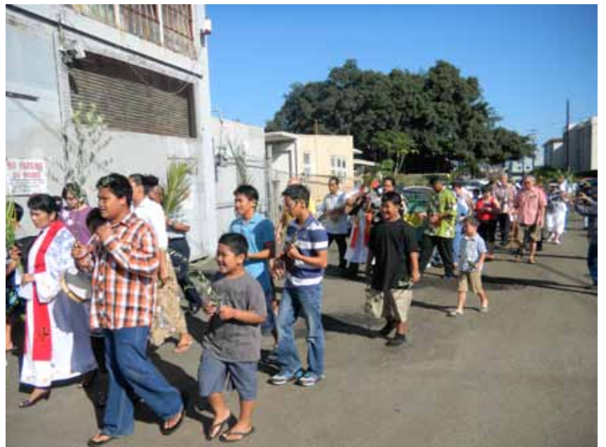
Who says youngsters don't come to church?!