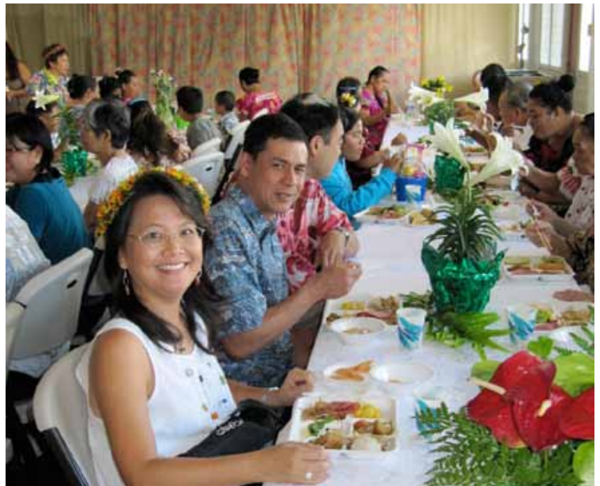
The food at the Champagne Potluck Brunch was FABULOUS!