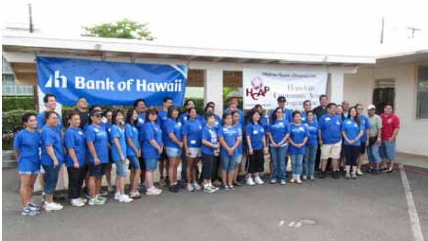
An army of volunteers from Bank of Hawaii and the Honolulu Community Action Program brightened Shim Hall with a shiny new coat of paint. Thank you for your great work!