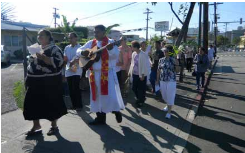
"The King of Glory comes, the nation rejoices. Open the gates before him, lift up your voices."