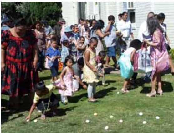
The Easter Egg Hunt is on!