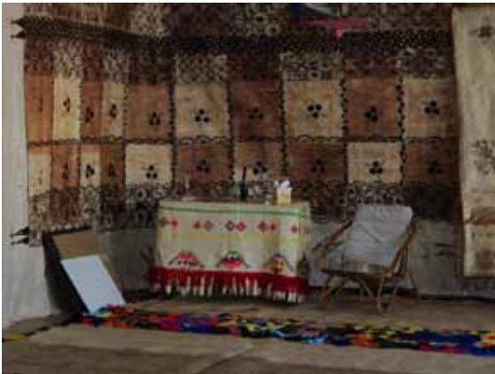
Shim Hall was lovingly arranged in traditional Tongan mourning cloths.