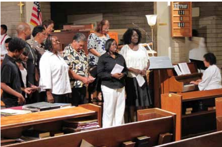
Music was provided by the Trinity Missionary Baptist Choir at the Jan. 16th ecumenical service honoring Martin Luther King, Jr.