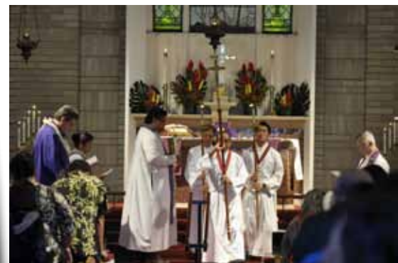
The Gospel Procession