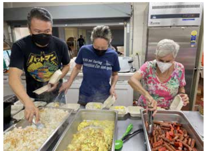
And last but certainly not least.... guess who's coming to dinner...er... breakfast??? So happy to have Mother Jodene's helping hand last Saturday morning!!!!